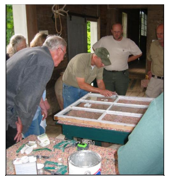
Workshop attendees learn how to relgaze historic wood windows. ["Historic Window Repair," City of Oregon, 2019, https://www.orcity.org/planning/historic-window-repair]

Most homeowners who are striving to improve their energy efficiency are seeking to lower utility bills and reduce their carbon footprint. While it may be tempting to blame your home's energy loss on its historic windows, in actuality roughly only 10% of energy lost is through windows. The bulk of energy loss comes from attics, doors, and floors. Windows manufacturers and installation companies widely promote that the new windows are "greener" than historic windows. In fact, repairing or restoring an original set of windows can not only meet the efficiency standards of new, but will far surpass them at price point, structural compatibility, and overall sustainability.