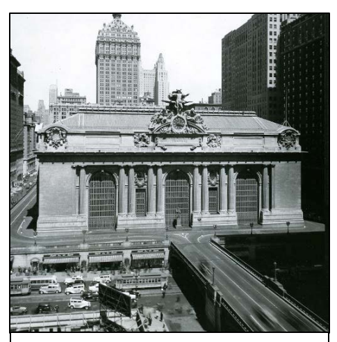
The Grand Central Terminal building in New York City, New York. [Grand Central Terminal, "Grand by Design: a History of Grand Central Terminal," 2017, https://www.grandcentralterminal.com/history

Historic preservation ordinances that stay within the confines of the enabling legislation have repeatedly been upheld by courts. The federal legal precedent against the claim of "takings" was set in 1978 with the landmark Supreme Court decision in Penn Central Transportation Company v. the City of New York. Penn Central's proposal to construct a large office tower atop the historic Grand Central Terminal was denied by the New York Landmarks Preservation Committee who found that the addition would detract from the historic character of the existing terminal. Penn Central argued that this denial violated their fourteenth amendment rights and should be considered a taking. Ultimately, the Supreme Court ruled that because Penn Central could continue to operate and make a return on its investment in the terminal in its historic formation, the Landmarks Preservation Committee's permit denial did not amount to a taking of property without just compensation.<sup>2</sup>