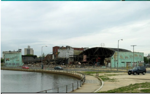
Asbury Park's former Palace Amusements, built in 1888 and considered to be a Victorian pioneer in the amusement industry, was listed in the National Register of Historic Places in 2000 but was ultimately demolished in 2004 after restoration efforts failed. ["Palace Amusements," Vintage Asbury Park, 2004, https://www.side-o-lamb.com/palace.

State : Listing a property in the New Jersey Register of Historic Places is also an honorary designation with a limited review process. Any projects carried out by state, county, or local governments that may impact resources listed in the New Jersey Register of Historic Places are subject to review by the New Jersey State Historic Preservation Office and the New Jersey Historic Sites Council. Unlike the federal law, however, the New Jersey state law is an actual authorization process, enabling the State Historic Preservation Office to make recommendations for a project to proceed. Properties listed in the state