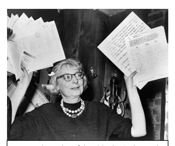
Jane Jacobs, author of the 1961 classic <u>The Death and Life of Great American Cities</u>, is credited with jumpstarting the grassroots historic preservation movement in response to rapid demolition of urban building stock in the 1950s and 60s. ["Who was Jane Jacobs?" Center for the Living City, 2019, http://www.janejacobswalk.org/about-jane-jacobs-walk/meet-jane-jacobs.

Today, historic preservation continues to benefit all members of society by preserving buildings that serve as tangible connections to our rich and often complicated past. Preservation is not focused solely on the sites of rich, white men. Rather, great strides have been made to highlight the histories of marginalized populations and preserve historic resources connected with this history. Preservationists give sites associated with the Underground Railroad or the Civil Rights Movement the same consideration as sites connected